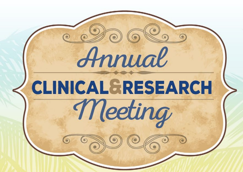
APRIL 12-14, 2018 Hilton West Palm Beach • West Palm Beach, Horida

North American Society for Pediatric and Adolescent Gynecology