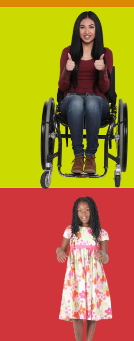
Exhibit and Sponsorship Opportunities